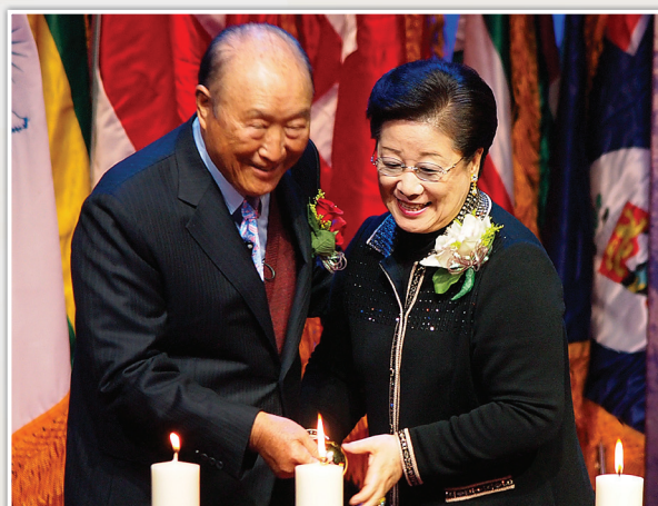
Rev. Dr. and Mrs. Sun Myung Moon Founders, UPF International