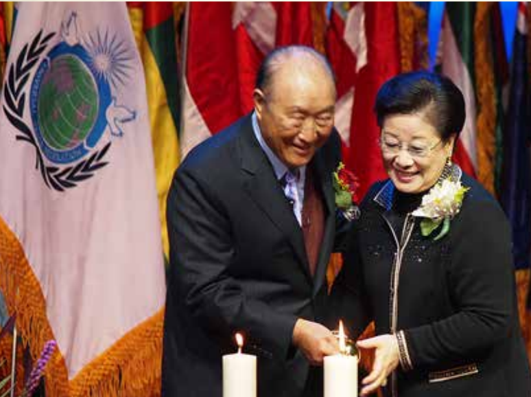
Founders: Rev. Dr. Sun Myung Moon and Dr. Hak Ja Han Moon

The Universal Peace Federation (UPF) is a global network of individuals and organizations dedicated to building a world of peace centered on universal spiritual and moral values. UPF and its global network of Ambassadors for Peace bring universal, spiritual principles to the task of resolving conflict and reconciling the divided human family. International Leadership Conferences, symposia, and peace councils offer opportunities for high-level consultations. These are complemented by “track two” diplomacy and grass-roots programs that build support for a culture of peace.