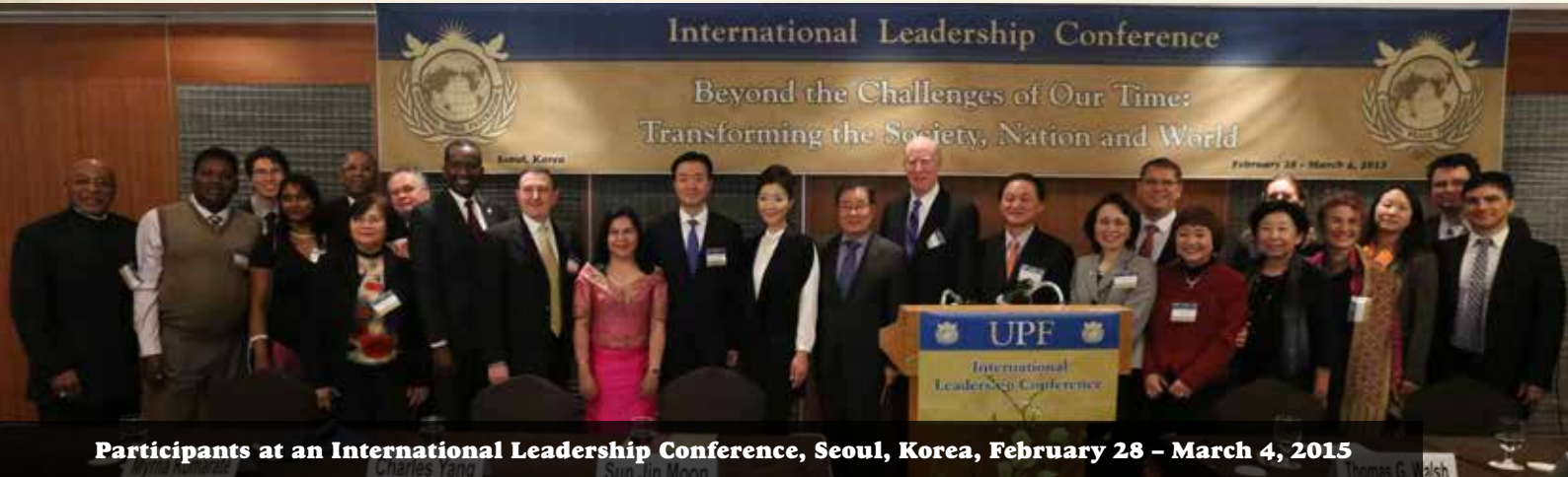
Participants at an International Leadership Conference, Seoul, Korea, February 28 – March 4, 2015

ILC PROGRAMS HAVE BEEN HELD THROUGHOUT THE WORLD, BRINGING TOGETHER THOUSANDS OF LEADERS FROM ALL WALKS OF LIFE